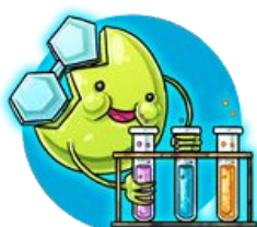
Biochemistry & Genetics (30+ videos)