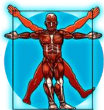
Anatomy (50+ videos)

100+ High-Yield Topics Covering 1,000+ Hardest to Remember Facts