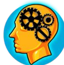
Psychology (30+ videos)