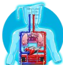
Human Physiology (60+ videos)